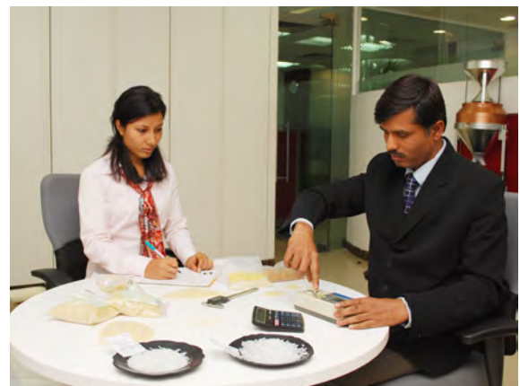
Al Maha Foods Lab, New Delhi